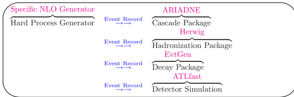
Figure 1: HepMC supports the concept of modularised event generation (illustrated above) by containing sufficient information within the event record to act as a messenger between two modular steps in the event generation process.

HepMC is an object oriented event record written in C++ for Monte Carlo Generators in High Energy Physics. It has been developed independent of a particular experiment or event generator. It is intended to serve as both a “container class” for storing events after generation and also as a “framework” in which events can be built up inside a set of generators. This allows for the modularisation of event generators—wherein different event generators could be employed for different steps or components of the event generation process (illustrated in Figure 1). 2