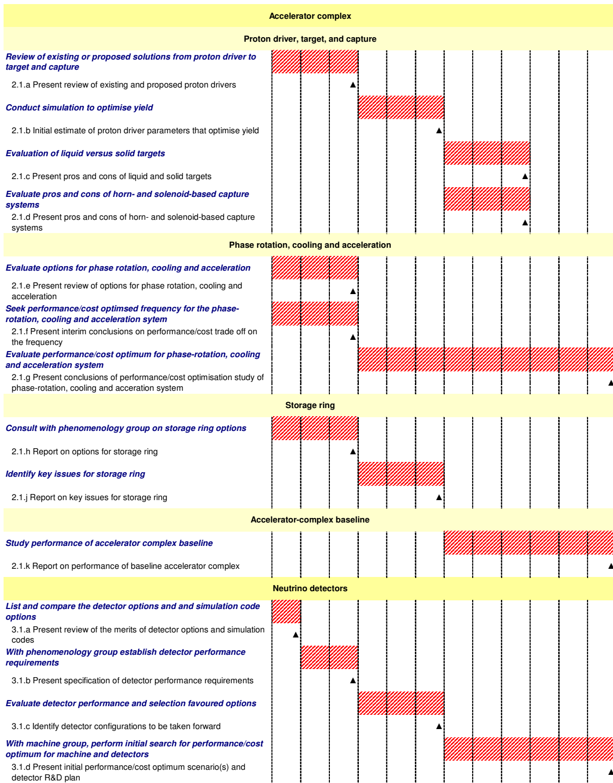
Figure A.1 continued: Schedule for the scoping study for a future neutrino complex. The Gantt chart shows the accelerator complex and neutrino detector schedule and milestones of the scoping study. The milestones are matched to the schedule of plenary meetings.