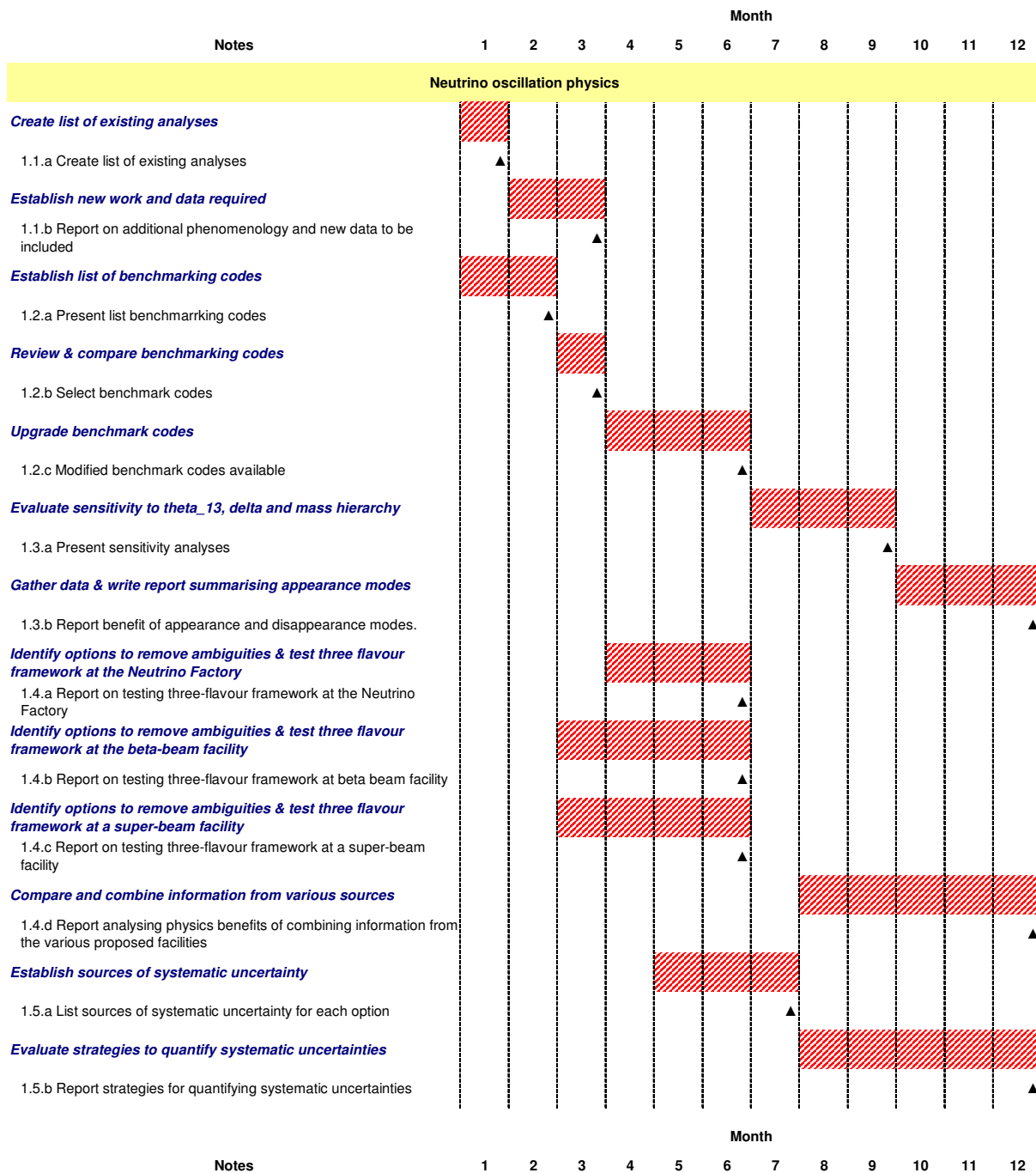
Figure A.1: Schedule for the scoping study for a future neutrino complex. The Gantt chart shows the neutrino-oscillation physics schedule and milestones of the scoping study. The milestones are matched to the schedule of plenary meetings.